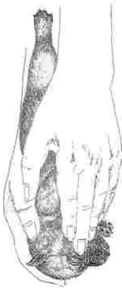
Figure 4 Figure Supine position